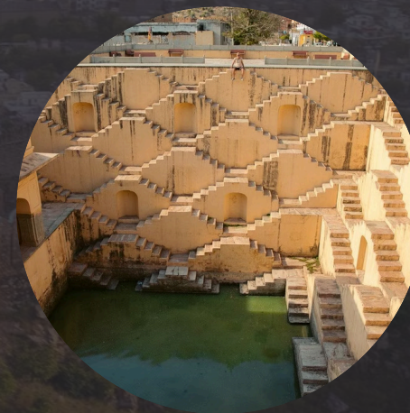
Panna Meena ka Kund

Admire the iconic "Palace of Winds" with its unique architectural design and stunning facade.