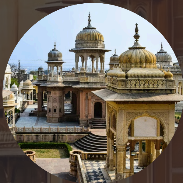
Gaitor ki Chattriyan

Ascend to the hilltop fortress and marvel at its impressive architecture and breathtaking vistas.